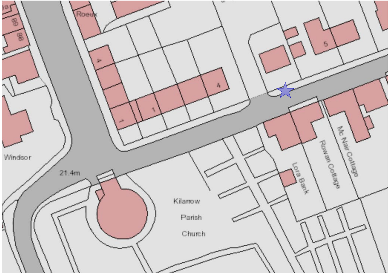
Disabled Bay associate with Lora Bank, High Street Bowmore