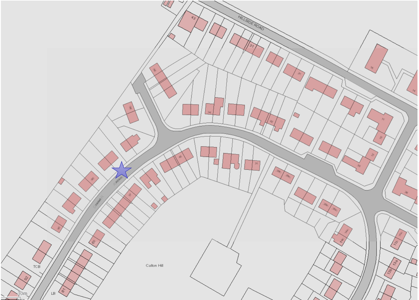
Disabled Bay associate with 55 Davaar Avenue, Campbeltown PA28 6NH