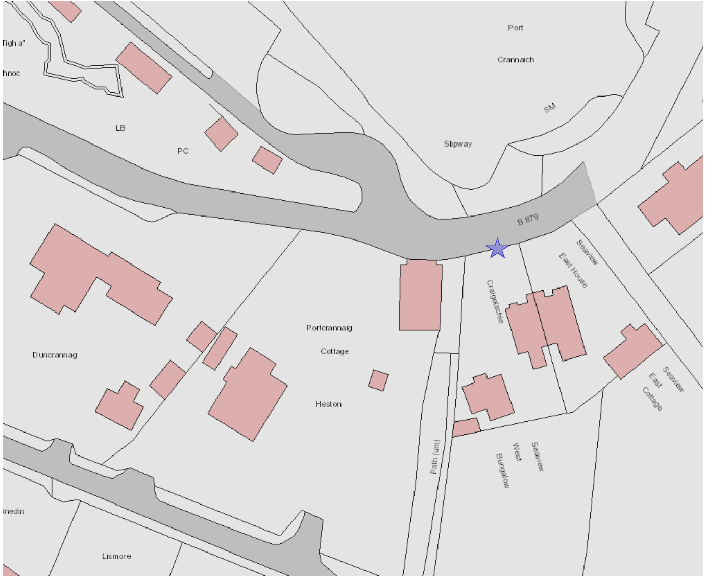
Disabled Bay associate with "Craigelachie", Glenfyne Terrace, The Pier, Carradale By Campbeltown PA28 6SQ