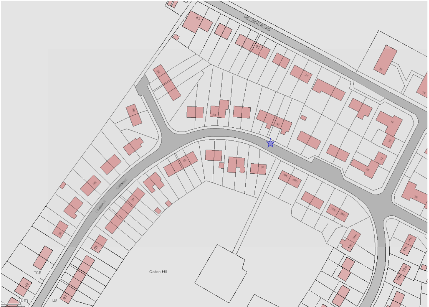
Disabled Bay associate with 42 Davaar Avenue, Campbeltown PA28 6NH