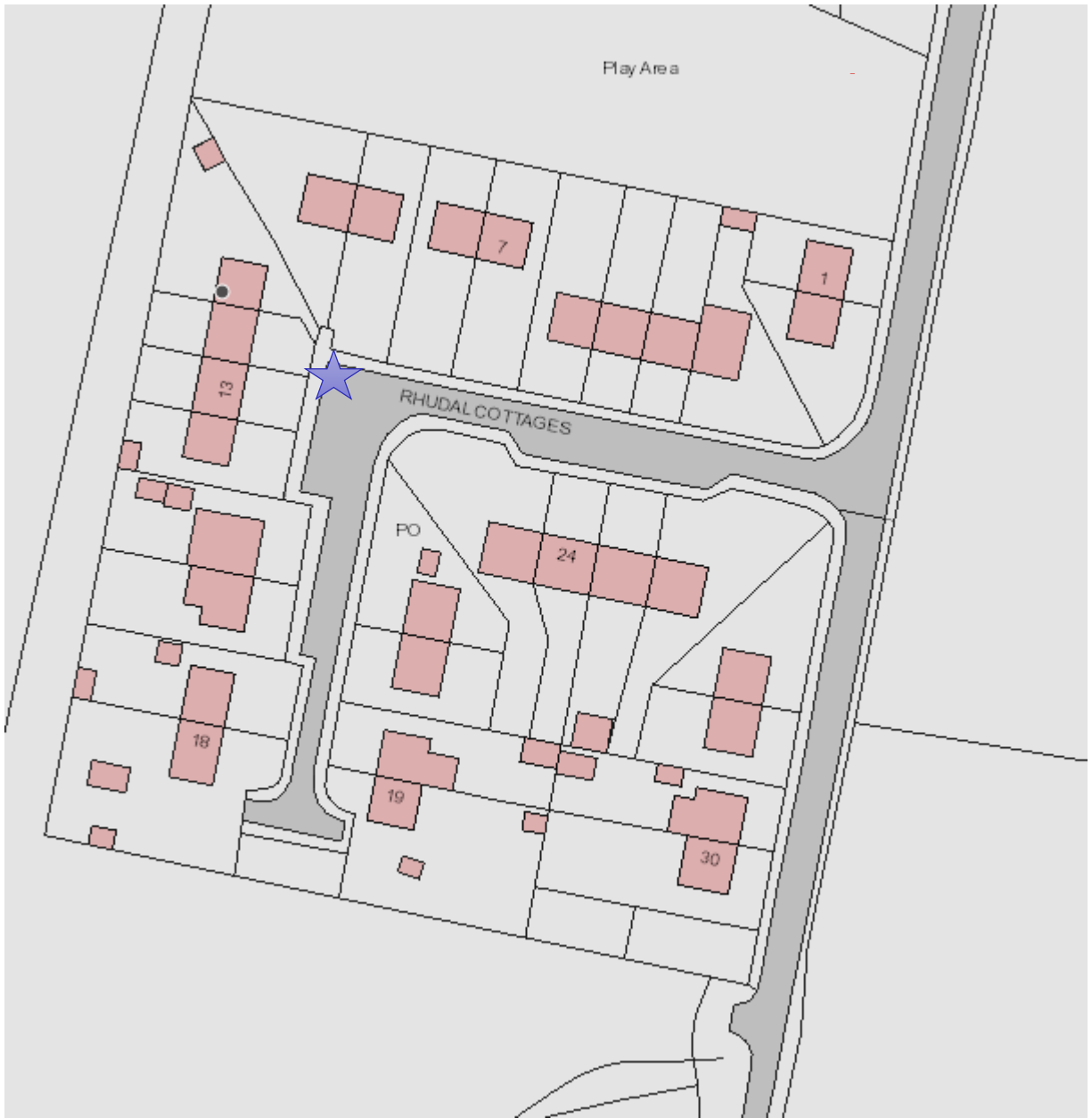
Disabled Bay associate with 11 Rhudal Cottages, Drumlemble