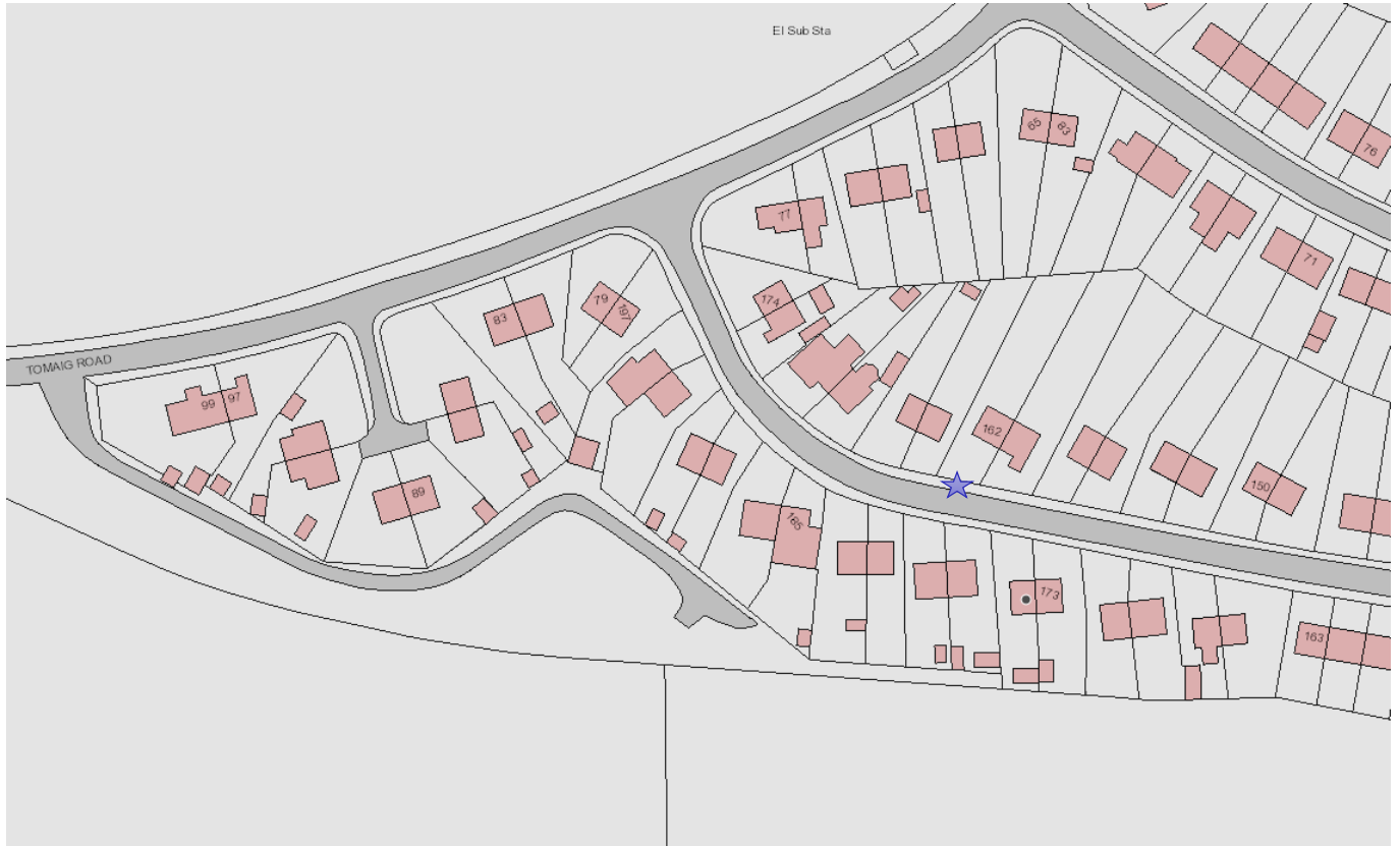
Disabled Bay associate with 177 Ralston Road, Campbeltown, Argyll PA28 6LG