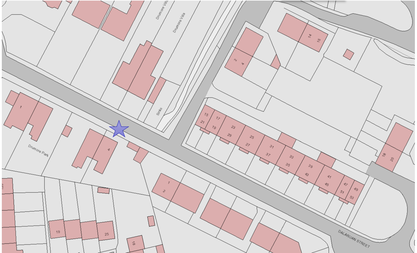
Disabled Bay associate with Kyle, Drymore, on Dalaruan Street, Campbeltown