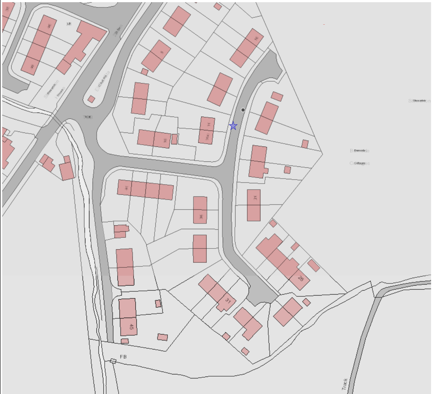
Disabled Bay associate with 11 Burnside, Stewarton PA28 6PQ