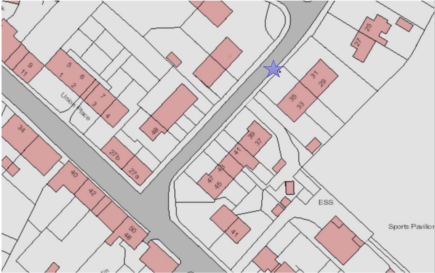
Disabled Bay associate with 33 Brodie Crescent, Lochgilphead, PA31 8NW