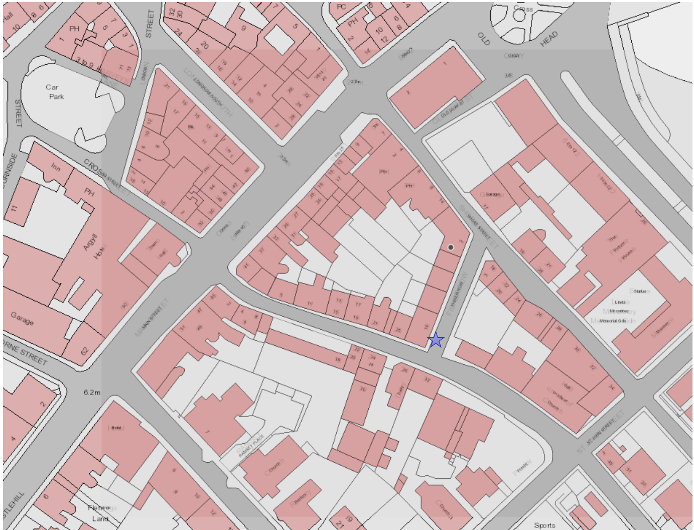
Disabled Bay associate with 25A Kirk Street, Campbeltown, PA28 6BL located on Fisher Row