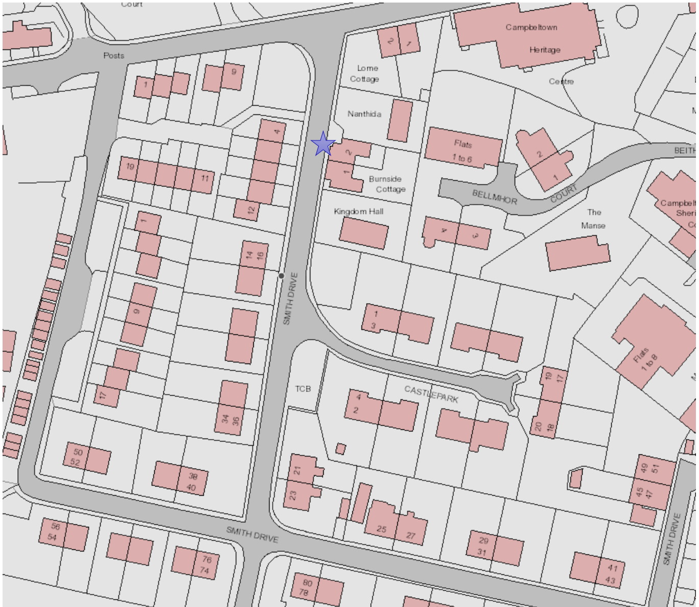
Disabled Bay associate with 2 Burnside Cottage, Smith Drive, Campbeltown, PA28 6LB