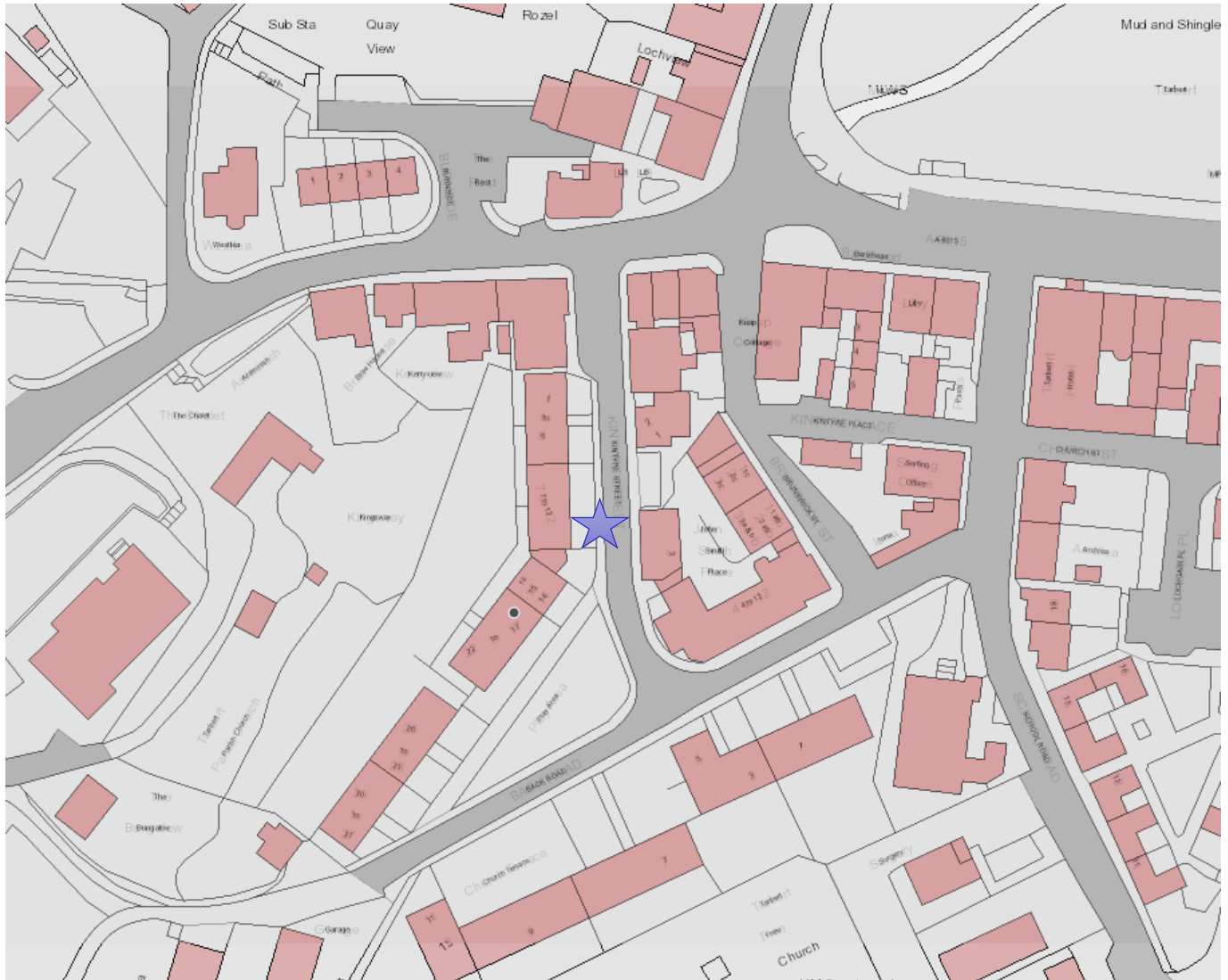
Disabled Bay associate with 9 Kingsway on Kintyre Street, Tarbert PA29 6UP