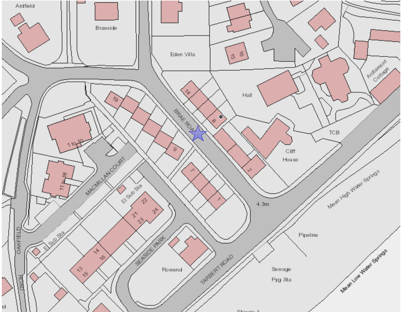
Disabled Bay associate with 8 Brae Road, Ardrishaig