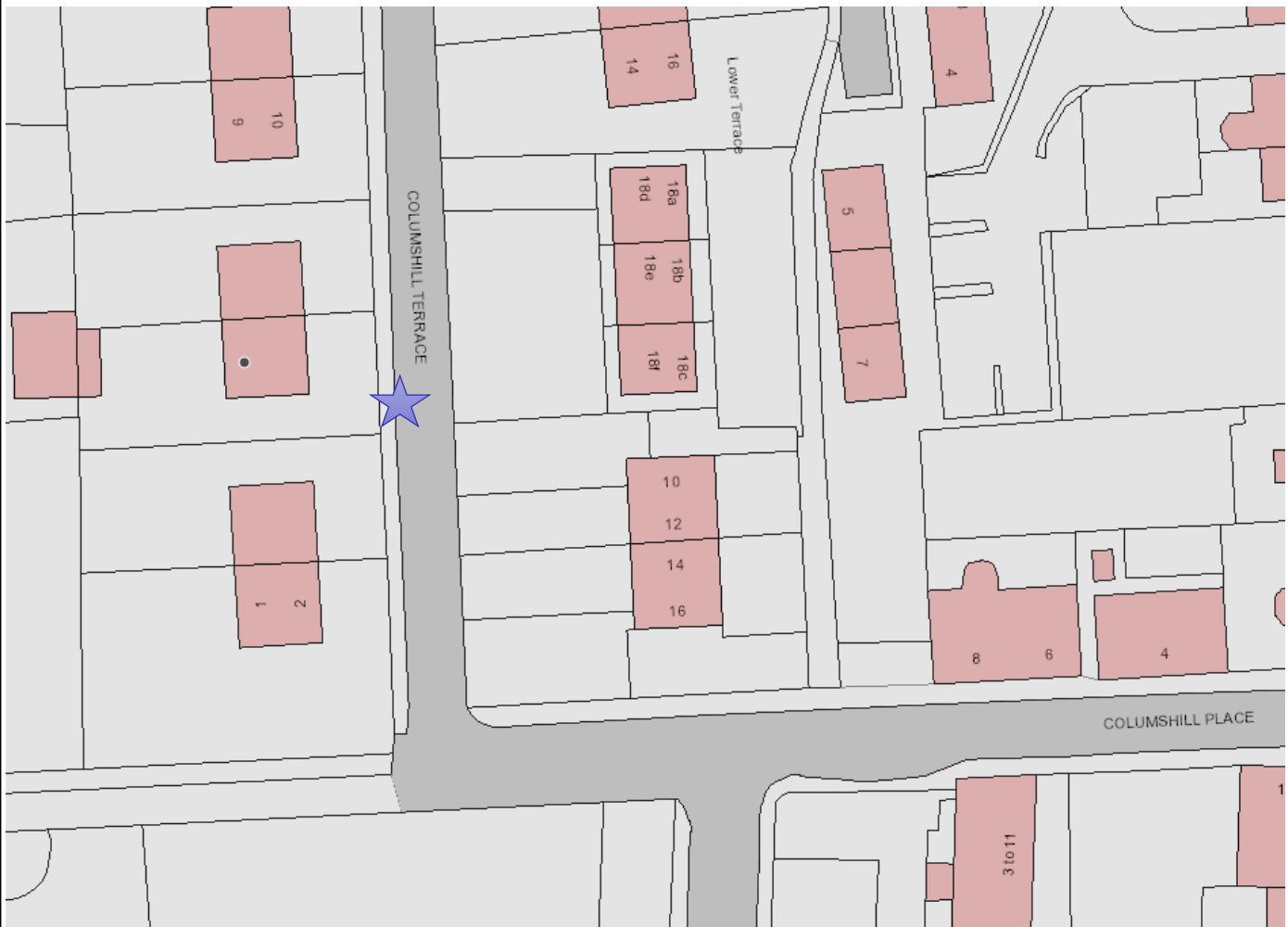
Disabled Bay associate with 5 Columshill Terrace