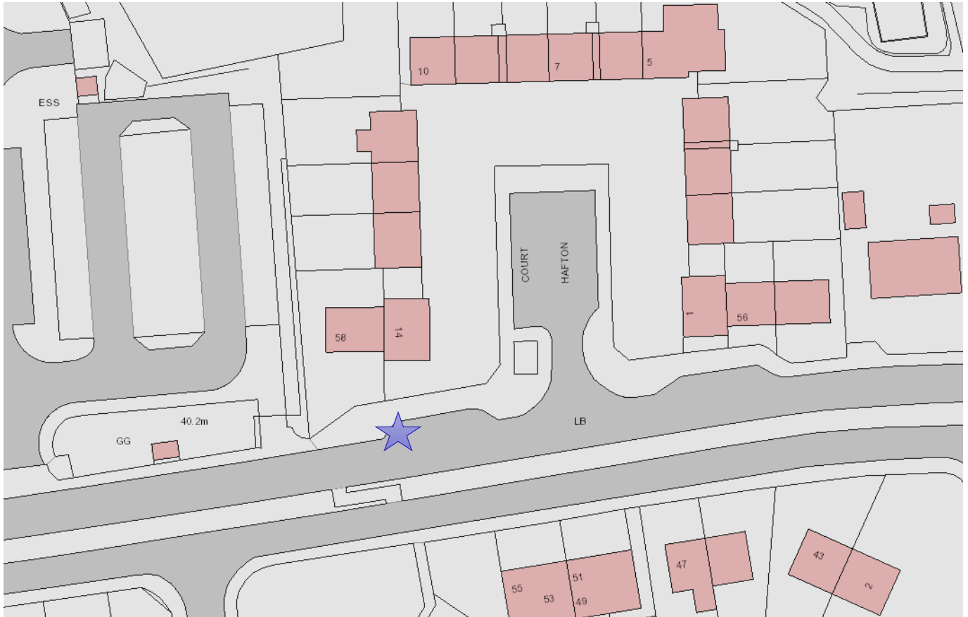
Disabled Bay associate with 58 Ardenslate Road, Dunoon