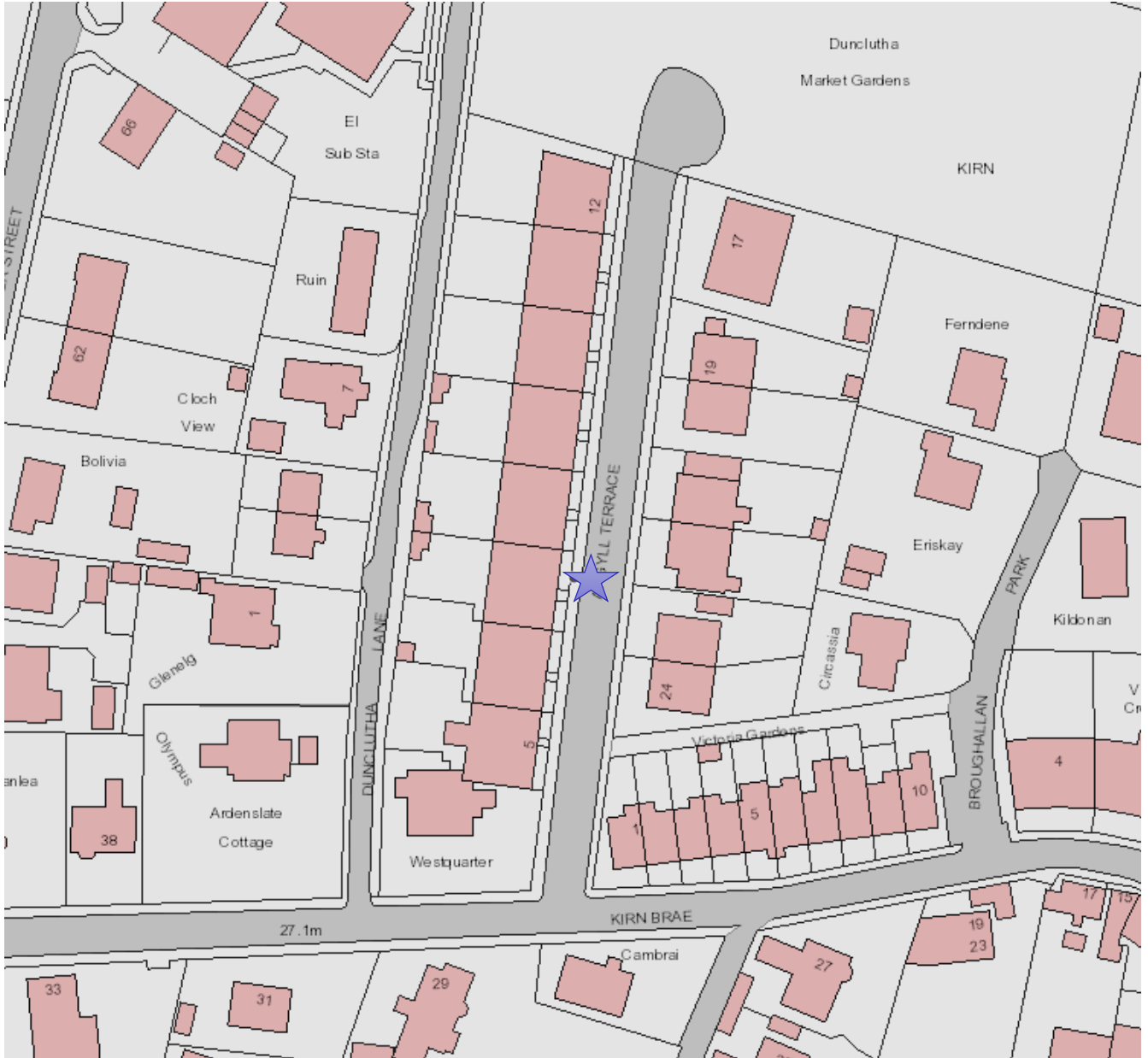
Disabled Bay associate with 8 Argyll Terrace, Kim, Dunoon