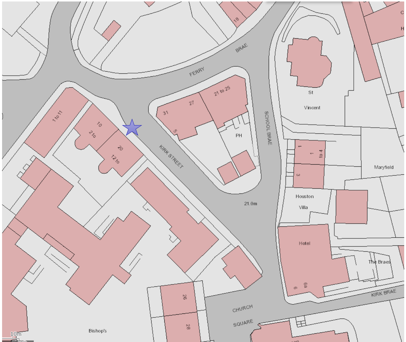
Disabled Bay associate with 5 Kirk Street, Dunoon