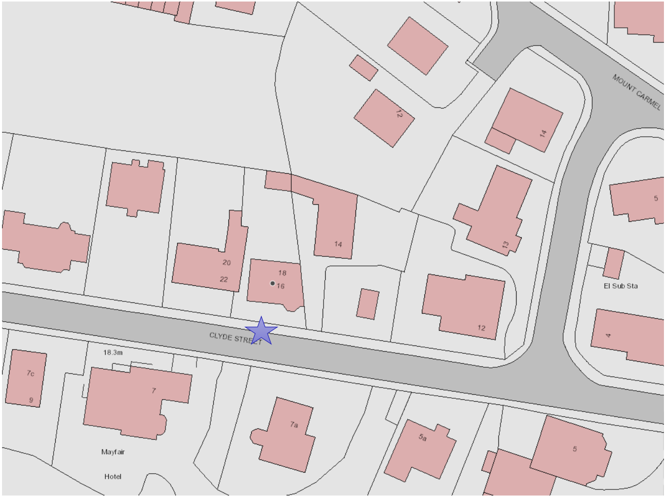
Disabled Bay associate with 16 Clyde Street, Kirn Dunoon