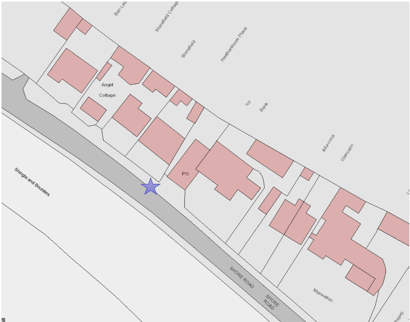
Disabled Bay associate with Ivy Cottage on Shore Road, near Strone Post Office, Dunoon