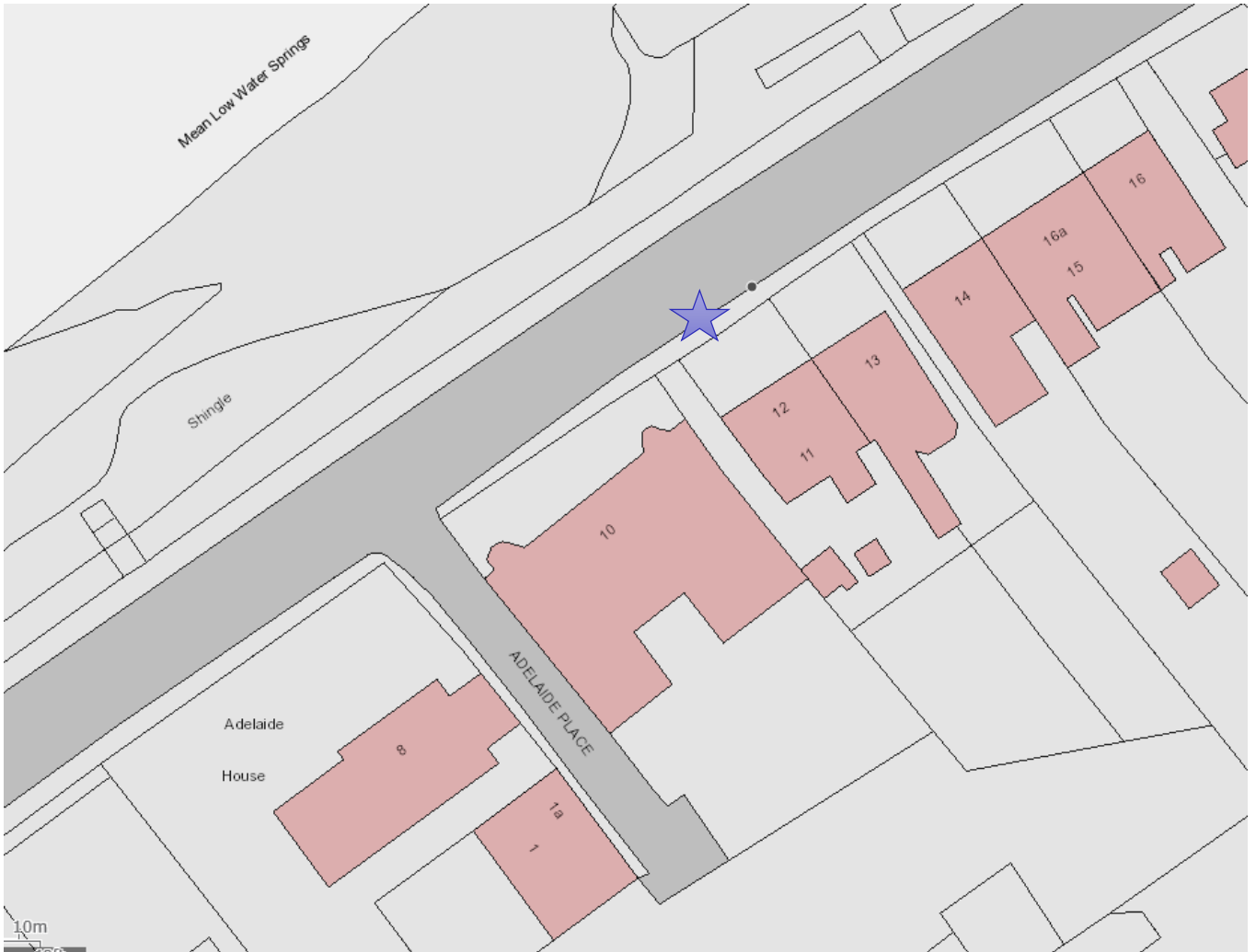
Disabled Bay associate with 12 Mount Stuart Road Rothesay