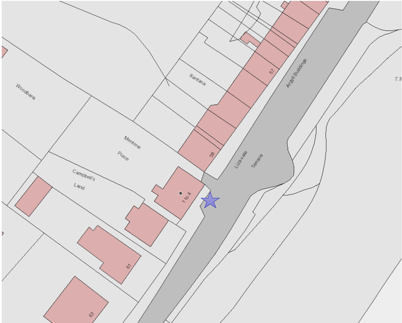
Disabled Bay associate with "2 Mentone Place" at 59 Shore Road, Innellan