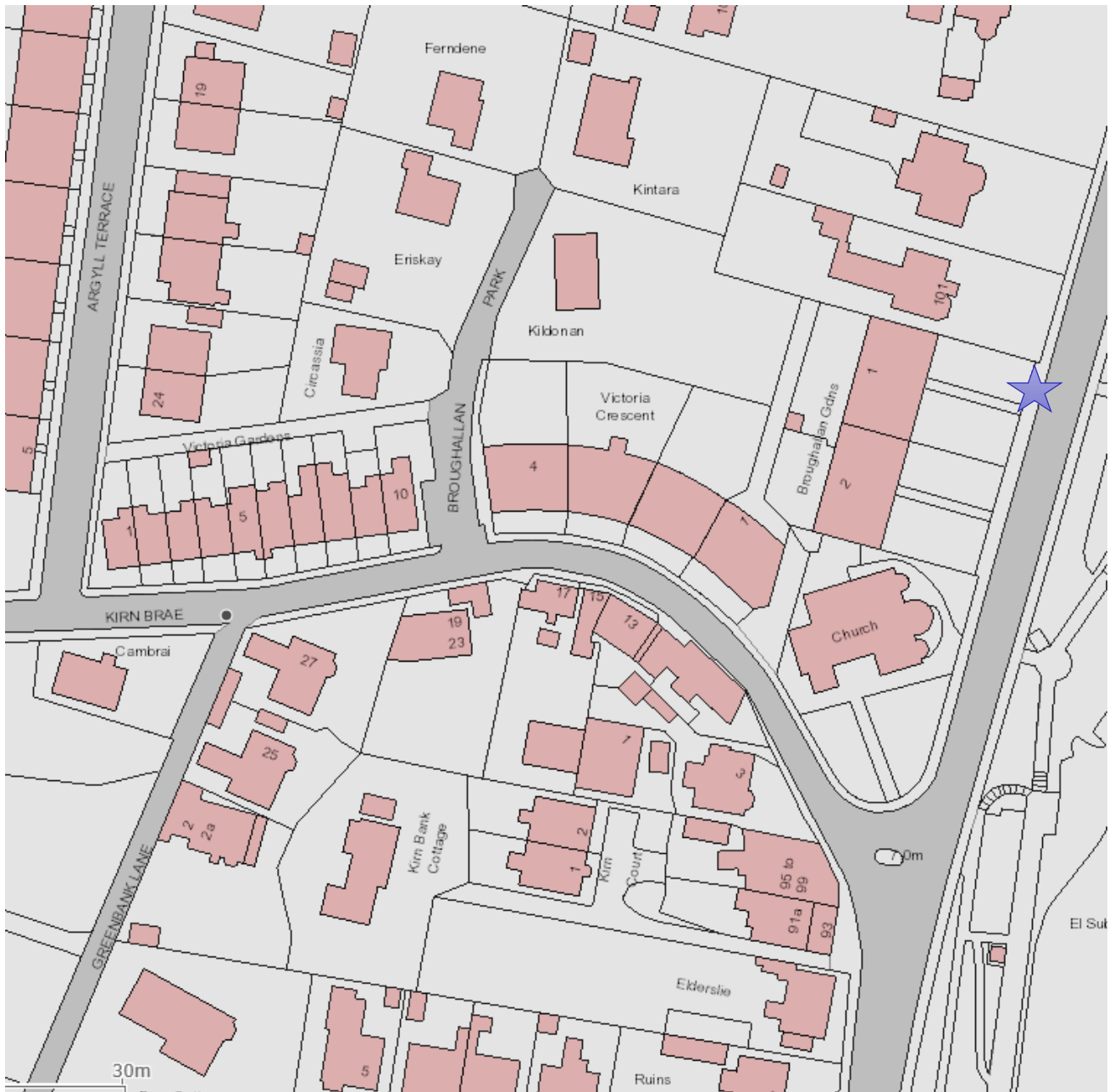
Disabled Bay associate with 1 "Broughallan Gardens"(on Marine Parade, Kirn, Dunoon