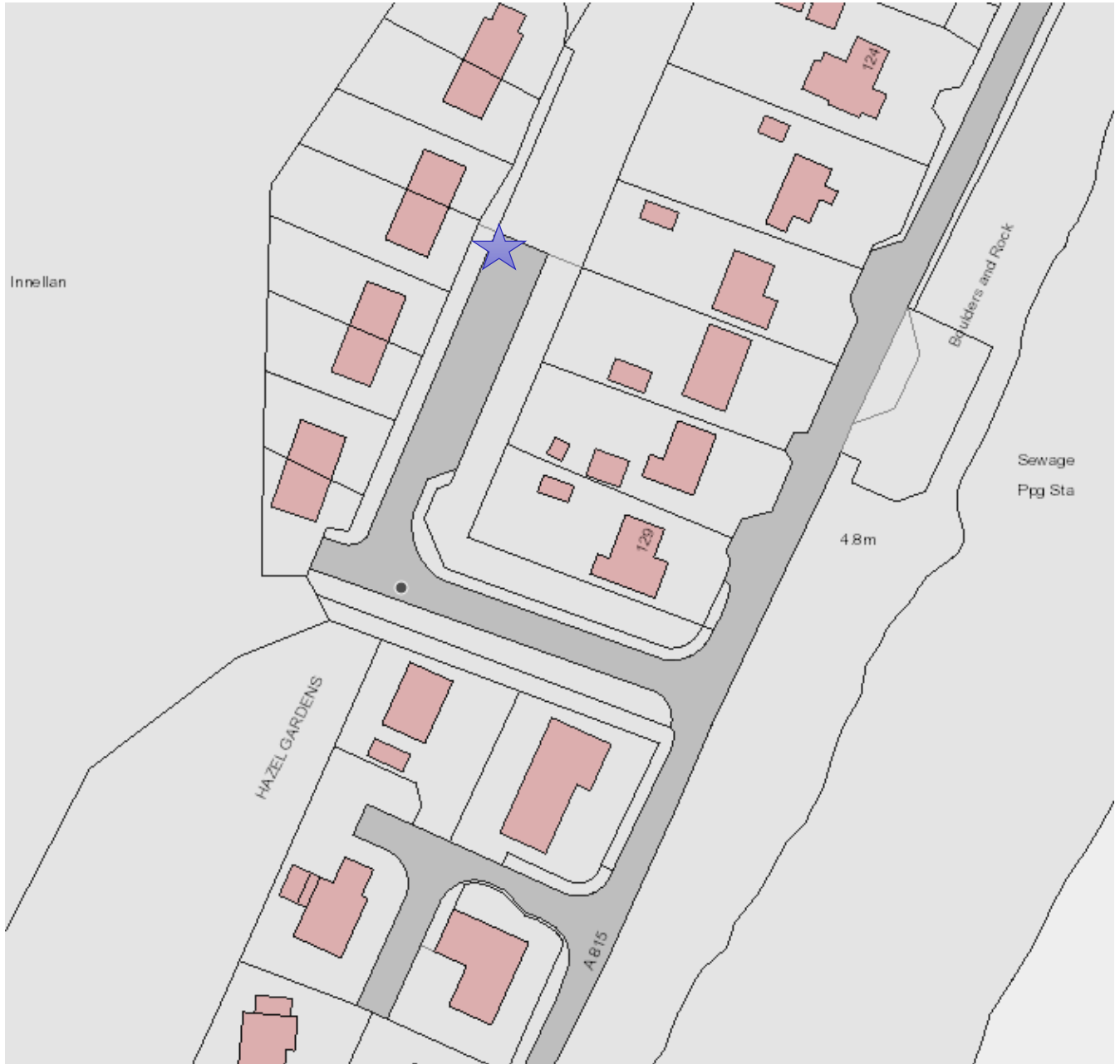
Disabled Bay associate with 5 Miller Avenue, Innellan