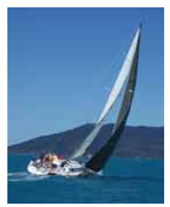
Excellent sailing territory

Today many archaeological artefacts and carved stones which date from Neolithic to Pictish times (from 3000 BC to 800 AD) can still be seen in the area and an excellent museum and interpretive centre at Kilmartin attracts thousands of visitors every year.