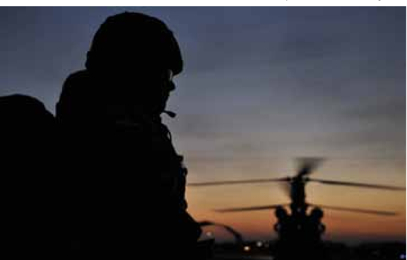
Camp Bastion, Helmand Province, Afghanistan

The RFEA's simple aim is to help those leaving the Armed Forces to find and to remain in employment throughout their working lives. This is done as part of the Career Transition Partnership (CTP) for up to two years after discharge and thereafter is done on behalf of the Service Benevolence Funds.