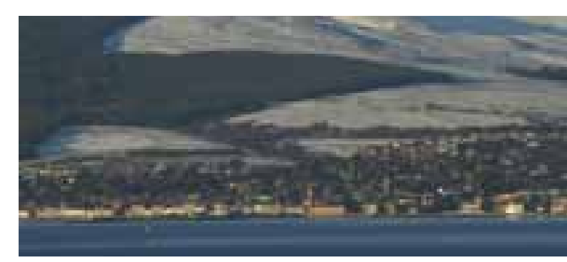
Helensburgh on the Firth of Clyde

Louise: Argyll and Bute has such beautiful scenery and so many places to visit, the area is so historic. The local people are friendly, welcoming and easy to talk to with a good sense of community spirit. People rally round. There is a good education system and the NHS facilities are availible. It's also close to both Glasgow and the airport, but still has a nice rural feel, with Loch Lomond on the doorstep.