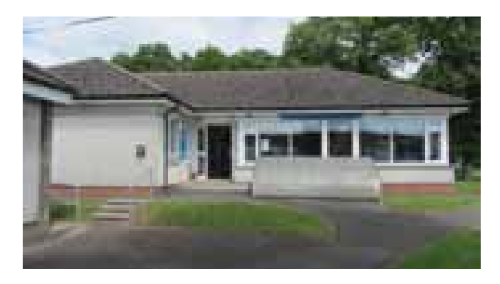
The Families Centre, Churchill Square

Separation from a spouse or partner being one example, military action and danger another RNRM Welfare provides advice and support for all service personnel and their families if needed. We have a single point of contact called the RNRM Portal with one telephone number 02392728777 and email address NAVYPERSWELFARE@mod.uk for access to our trained welfare staff.