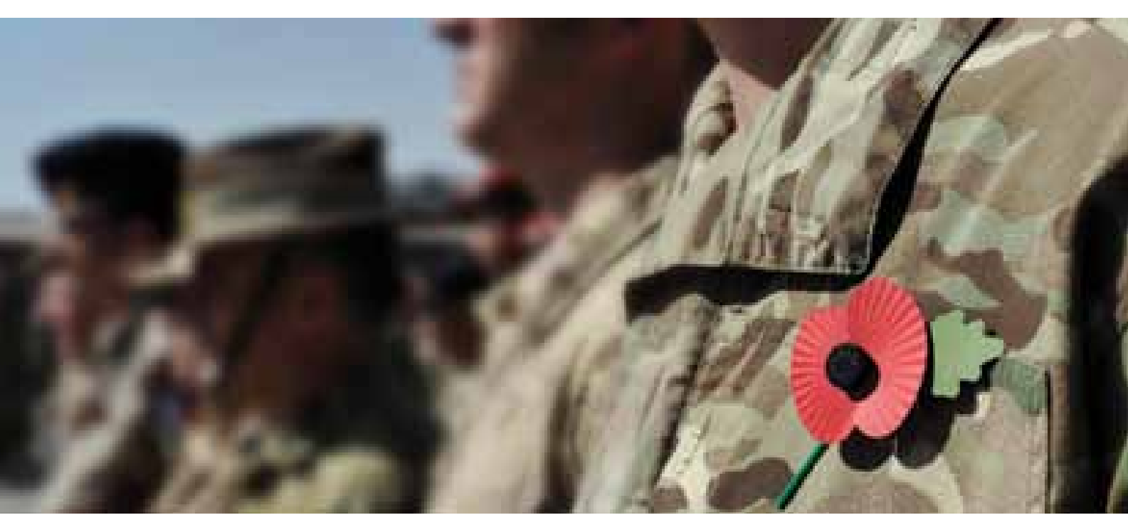
Remembrance Day, Kandahar

Schools in the Helensburgh and Lomond area are already benefiting from the education element of the Covenant Grant fund, with additional support for teaching staff, family liaison and training opportunities. Over four financial years, local schools have received over £367,820 in extra support.