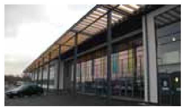
Lochgilphead Joint Campus

Sian: I really like the small class sizes compared to down south. We like to make use of the <u>children's clubs</u> locally and at the Sportsdrome at the Base. But buy some wellies and umbrellas beacuse it rains.....a lot!!!