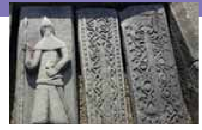
Carved stones at Kilmartin

The early kings of Dalriada were crowned at their capital at Dunadd – a fortified dwelling set on a rocky promontory