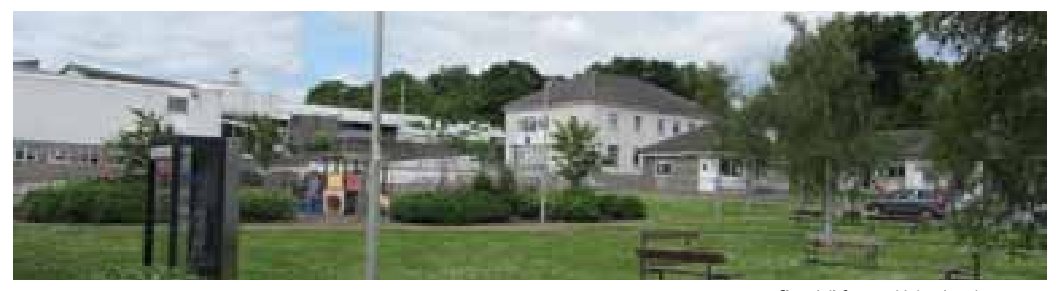
Churchill Square Helensburgh

Irene: There are a lot of community groups for military families with two large housing estates, <u>a</u> good chance to meet new people including non-military friends. There are plenty of upgraded parks in Helensburgh and plenty of clubs and groups for children.