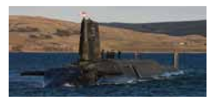
The Trident nuclear submarine HMS Victorious near Faslane.