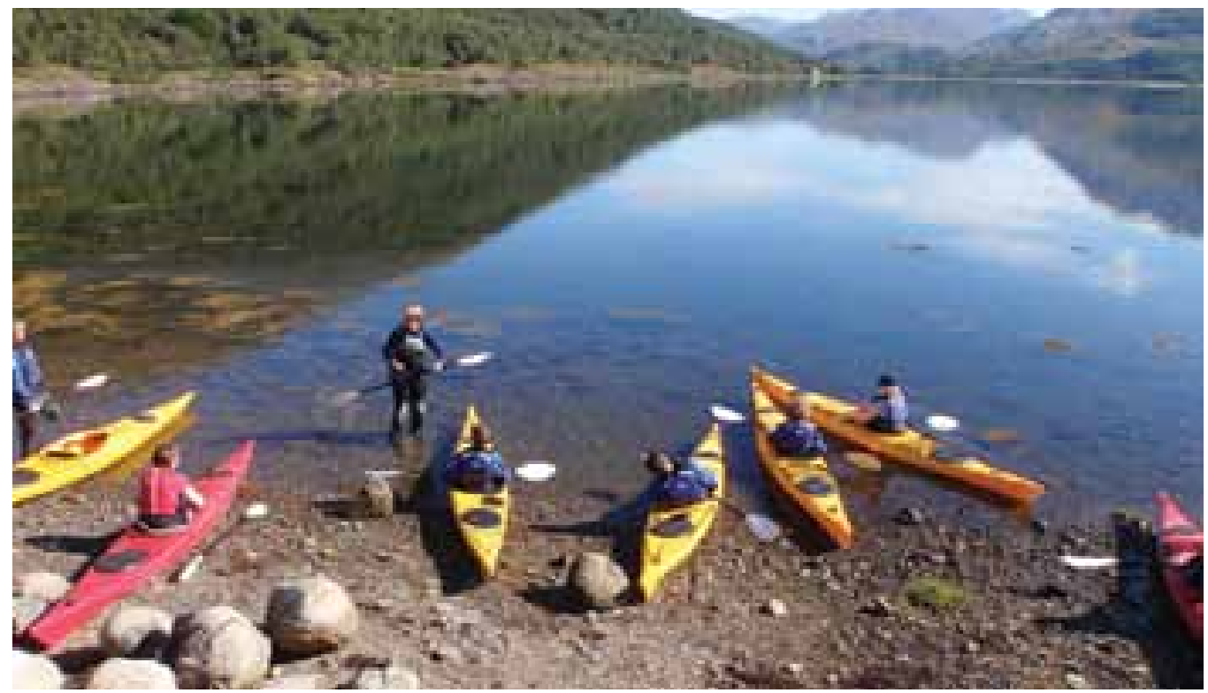
Argyll and Bute - a watersports paradise

This brochure provides printed information for you to keep and refer to, but to find out more about the area and what council services are available as well as links to other websites which may be useful to you please go to www.argyll-bute.gov.uk