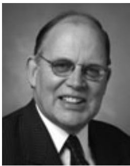
Adam Ingram Minister for Children and Early Years

The publication of this document is not the end of the story. Rather, it is an important milestone in an ongoing partnership that we are determined to build on as we move forward with implementation. We look forward to doing so for the benefit of Scotland's children.