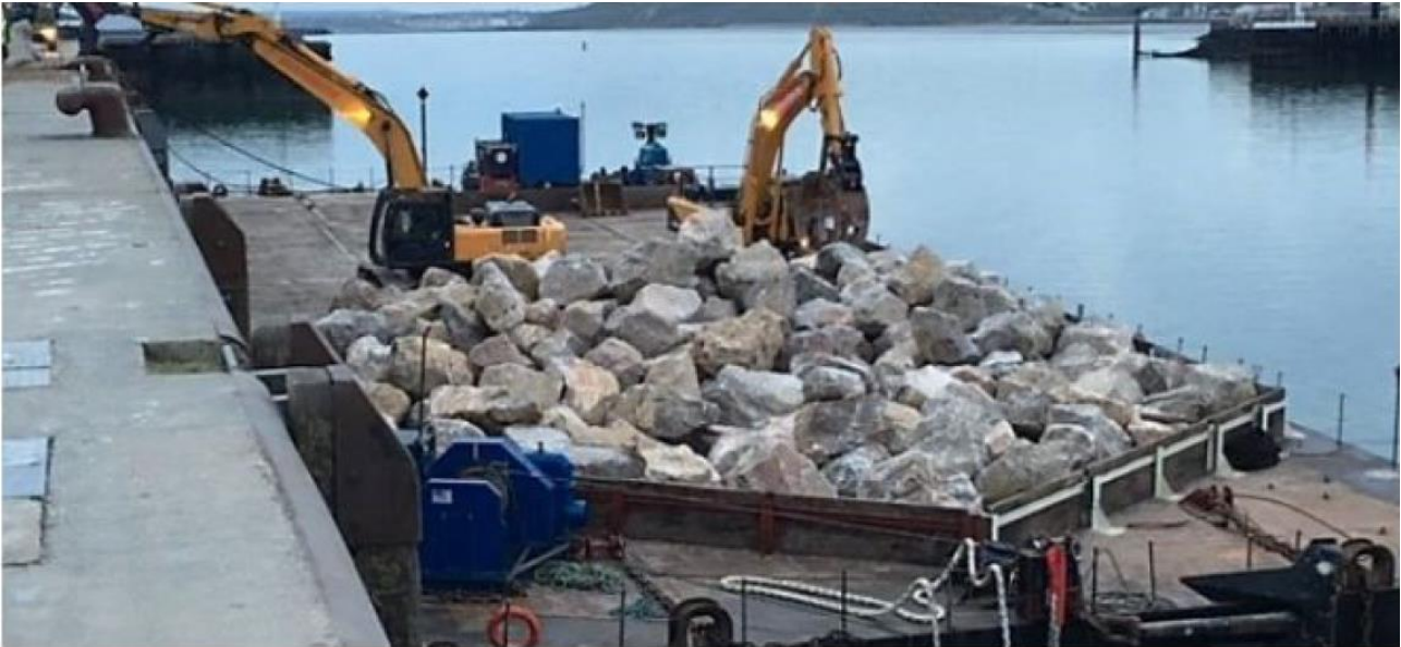
The barges will be supported by workboats NEW ROSS 1, SARAH GREY, and LESLEY M.